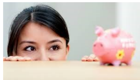
Accounts with no activity for twelve months are classified as dormant

To avoid this, we encourage you to take action as soon as possible. Please contact a branch nearest you to assist in protecting your funds.